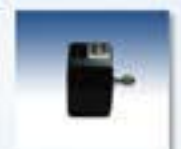
Brush DC Miniature Motor