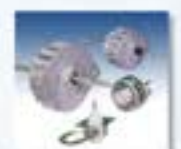
Digital Linear Actuator